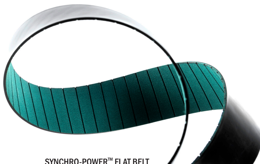
SYNCHRO-POWER™ FLAT BELT